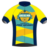
3: BEESTON, Sam Pro Vision Race Team